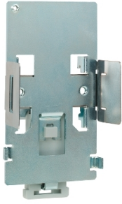
plate for mounting on symmetrical DIN rail - for variable speed drive